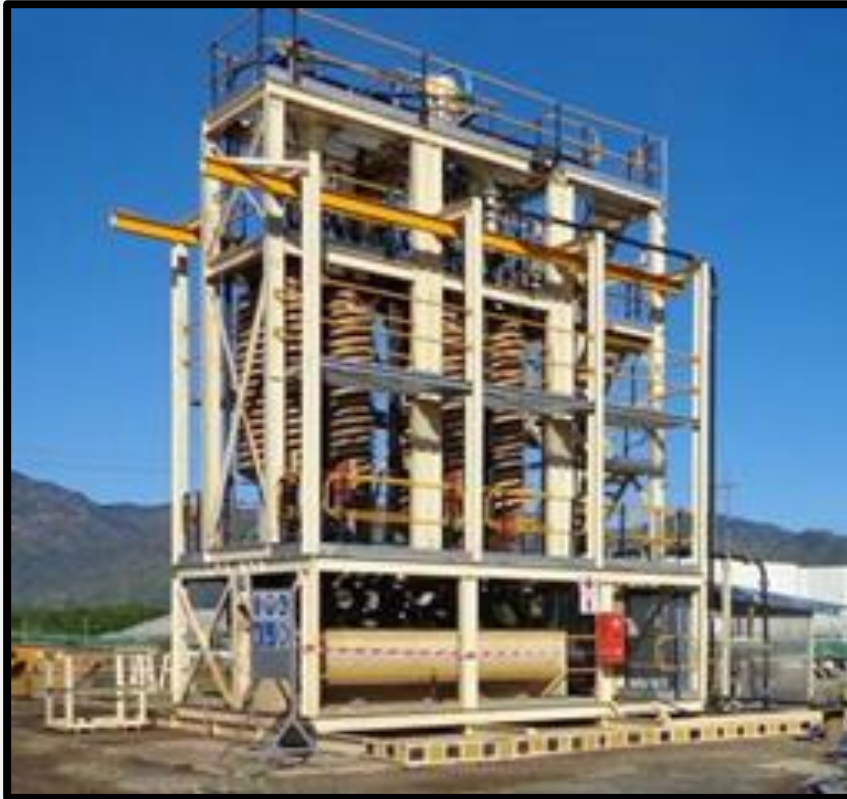
Figure 1. The fully operational pilot plant prior to disassembly and shipment to Mutamba

The pilot plant was constructed and tested under the direction of Rio Tinto in 2012 in South Africa ( Figure 1 ) before being disassembled and packed into containers and shipped to the Mutamba site.