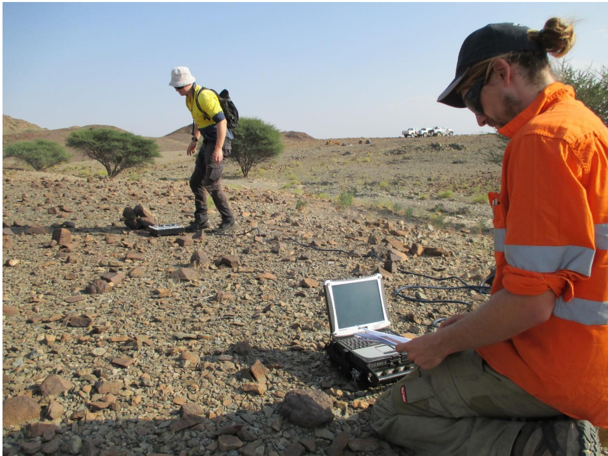
Figure 2. Ground Electromagnetic Survey Underway at Sarami West Prospect