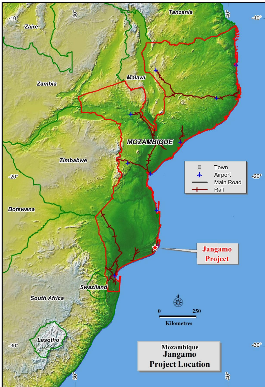
Map 1 – Matilda Minerals’ Location in Mozambique