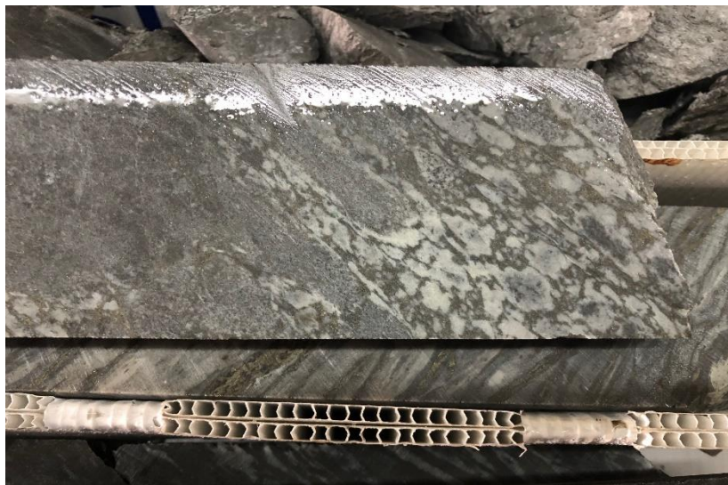
Figure 2: Core from the current drilling campaign at the Jones-Keystone-Loflin Project