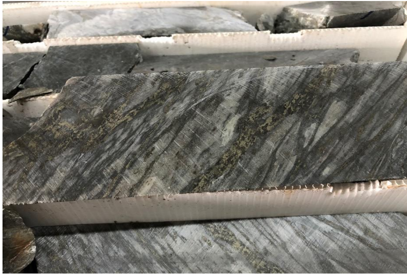
Figure 3: Core from the current drilling campaign at the Jones-Keystone-Loflin Project