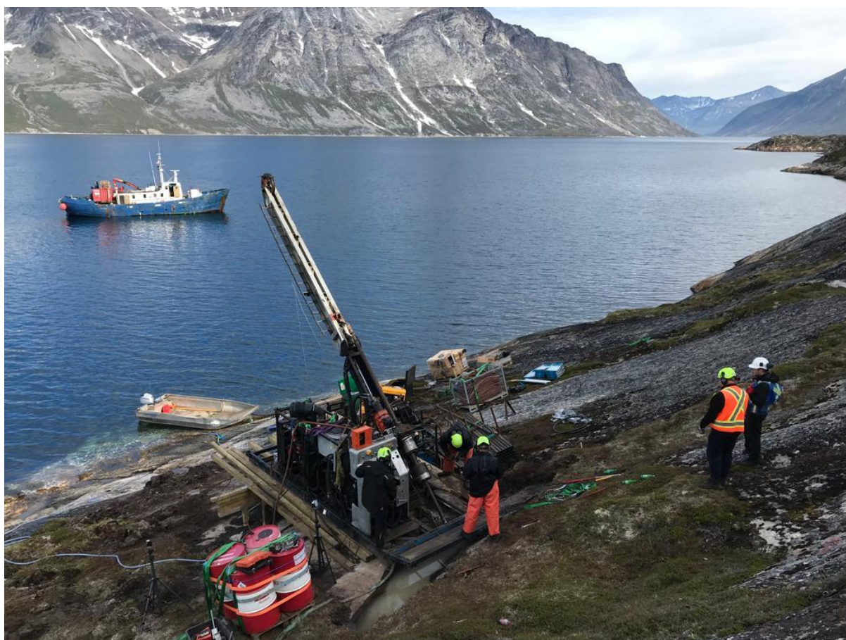
Figure 3: Phase 2 drilling at Amitsoq Island, July 2022.

GreenRoc is pleased to confirm that Phase 2 drilling has now commenced at the Amitsoq Island deposit. See the RNS dated 6 June 2022 for further details of the drilling programme.