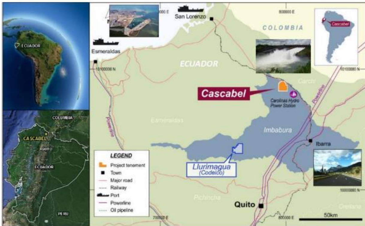
Figure 1: Location of Cascabel project in northern Ecuador, highlighting the significant capital advantages held by the project, with proximity to ports, road infrastructure, hydro-electric power stations and the trans-continental power grid.