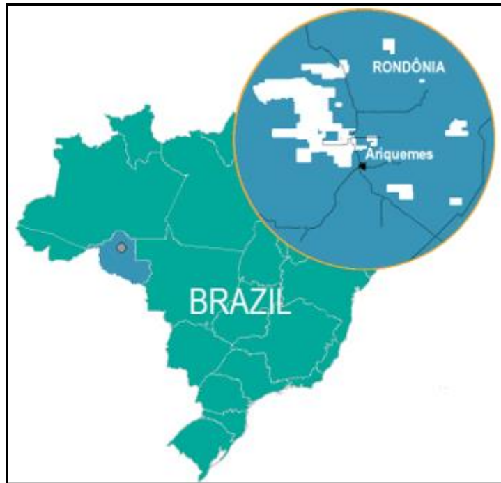
Figure 1. Ariquemes Project Location