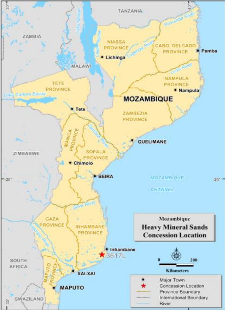
Figure 2 – Jangamo Project Location

Savannah has commissioned leading mineral sands consultancy TZMI to review all the currently available data including recent assay data to characterise the opportunity and determine the best path to progress the project to a scoping study level.