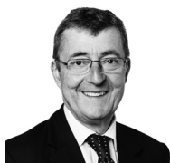
Sir James Leigh-Pemberton

The first six months of this year have witnessed exceptional economic, societal and market turbulence. In order to deal with the pandemic, governments have imposed restrictions which have led to one of the most rapid and severe contractions of economic activity in living memory. At the same time, together with monetary authorities, they have implemented programmes of fiscal and monetary stimulus on an extraordinary scale to cushion this shock. In the face of these two powerful forces, markets have exhibited extreme levels of volatility. The S&P 500 reached an all-time high on 19 February, then fell 31% over only five weeks, before recovering 39% to end the period down 4% overall. Other markets have seen similar volatility, though few have recovered to the extent seen in the US which has been driven by the performance of a small number of large-cap technology stocks; for example in the UK, the FTSE All Share see-sawed before ending the period down 19%. Nor was this unprecedented volatility confined to equities; credit, commodity and currency markets all experienced wide swings.