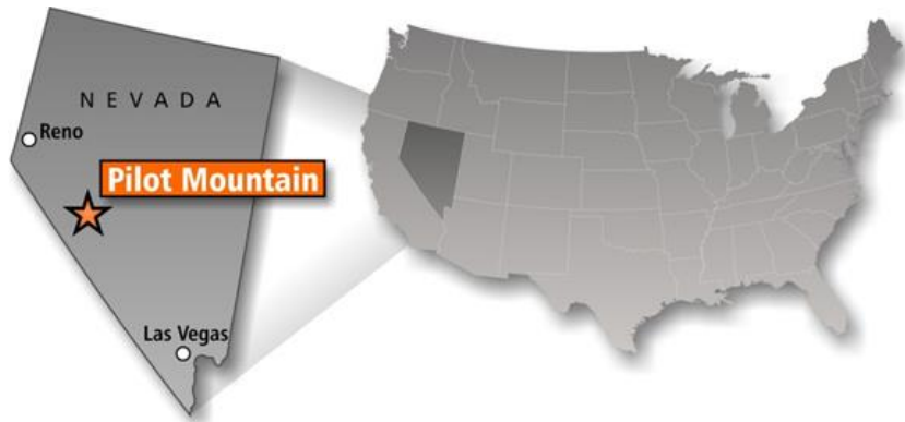
Figure 1: Pilot Mountain location map