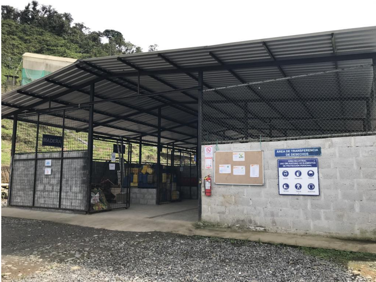
Figure 4: Existing waste management and recycling area at Alpala camp