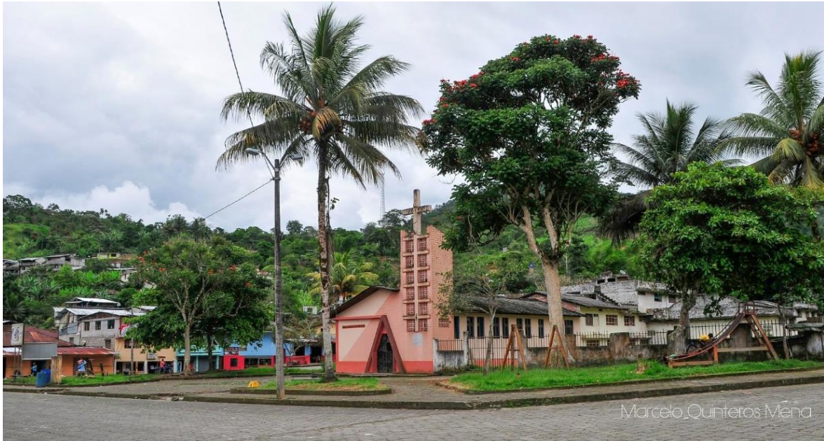
Figure 2: Lita Parish