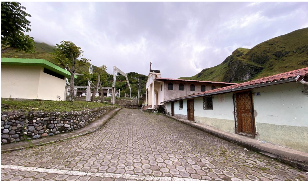
Figure 3: La Carolina Parish