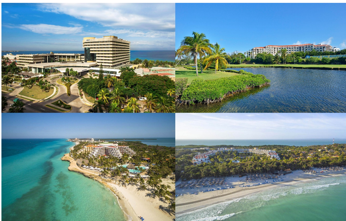
Miramar Hotels views (Clockwise from top left: Meliã Habana, Meliã Las Americas, Sol Palmeras and Meliã Varadero Hotels)

The Hotels are operated by Meliã Hotels International S.A. (“ Meliã Hotels International ”), which also has a 17.5% equity interest in Miramar (and a 10% equity interest in TosCuba).