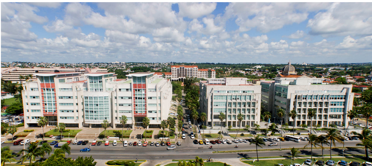
Miramar Trade Center view from 3rd Avenue

The largest real estate holding of the Company is its 49% interest in Inmobiliaria Monte Barreto S.A. ("Monte Barreto"), the Cuban joint venture company that owns and operates the Miramar Trade Centre, a six-building mixed-use commercial real estate complex comprising approximately 56,000 square metres