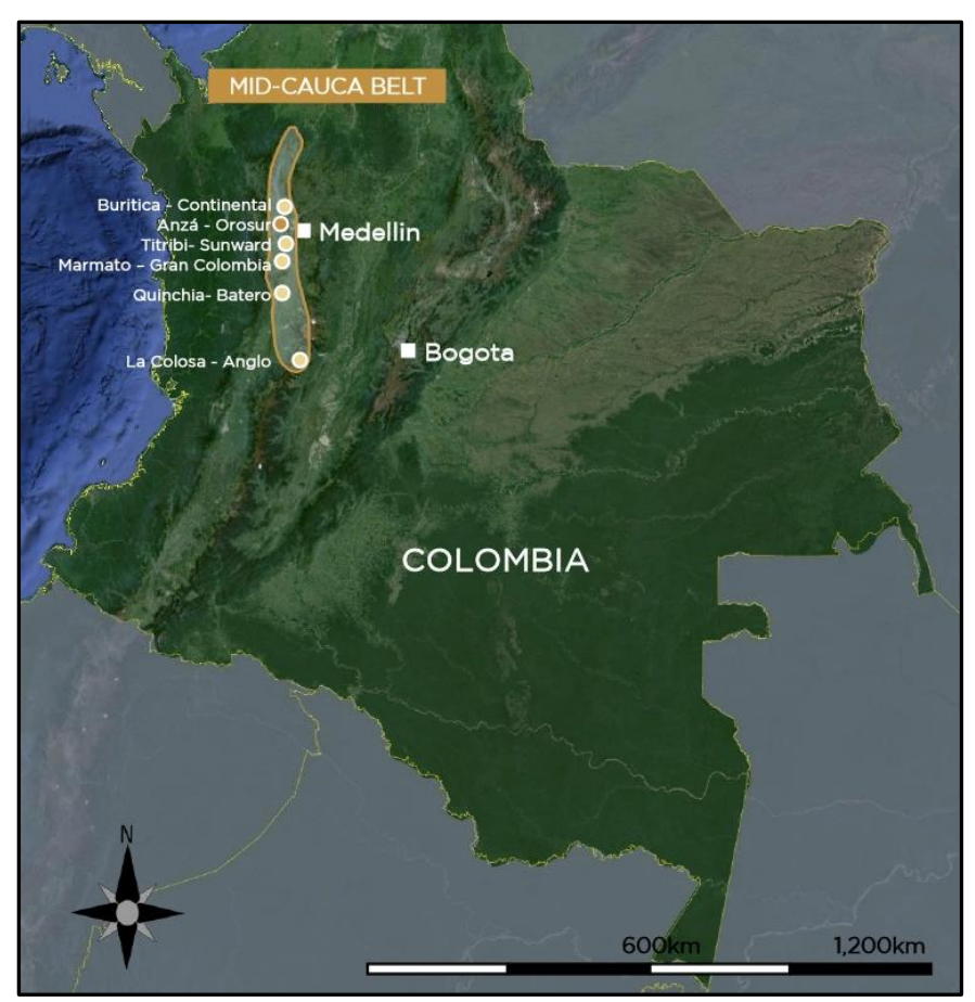
Figure 1. Anzá Location Map

The Anzá Project was acquired by Orosur in 2014, via the acquisition by Orosur of Canadian company Waymar Resources (Waymar) (TSXV:WYM).