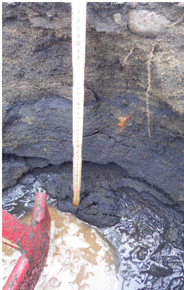
Figure 2: Ilmenite accumulations in trench east of Interlak delta, thick layers of black sands are ilmenite rich material.

On the drowned beaches a total of 240 samples were taken from both the larger vibracore on the MV Kisaq vessel as well as the smaller pontoon unit. Vibrocoreing is a technique for collecting core samples in shallow water environments and wetland soils.