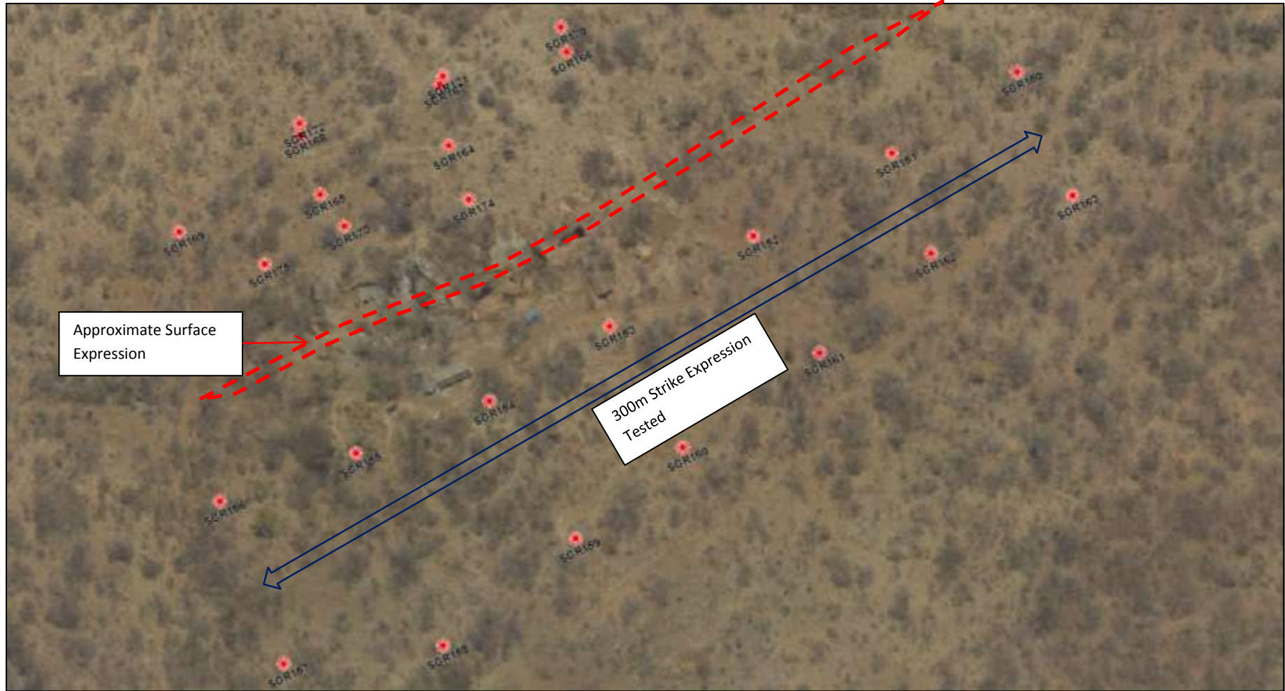
Figure 1: Digital Lidar-derived Image – Drill Collars and Schematic Surface Expression of Mineralised Zone superimposed