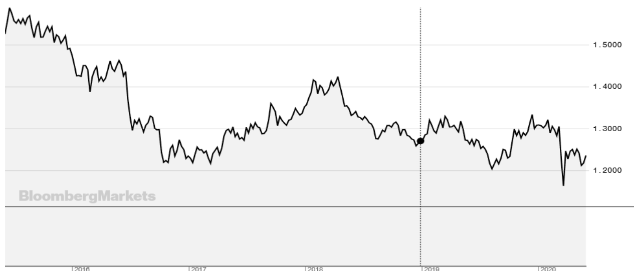
GBP / USD Exchange Rate : 5 year Trend