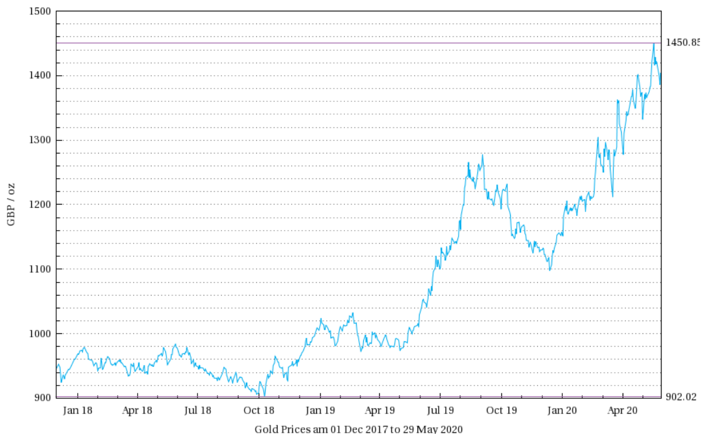
Graph of GBP Gold price for the period Dec 1, 2017 to May 29, 2020

Galantas has a policy of being un-hedged in regard to gold production.