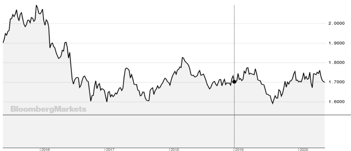
GBP / CAN Exchange Rate : 5 year Trend