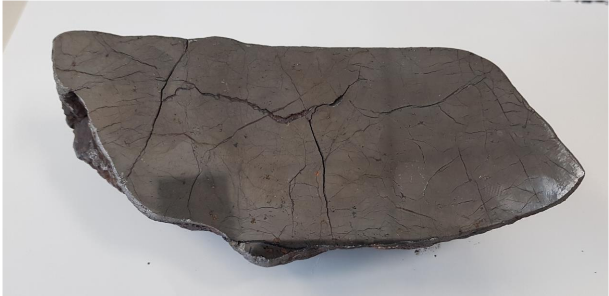
Figure 1: Polished section of MMS material taken from outcropping gossans:

Results from both Area 1 and Area 2, together with historical data, will continue to be assessed in the coming months to refine targets for future exploration work. The Company continues to consider the area to be highly prospective and remains dedicated to its ongoing exploration.