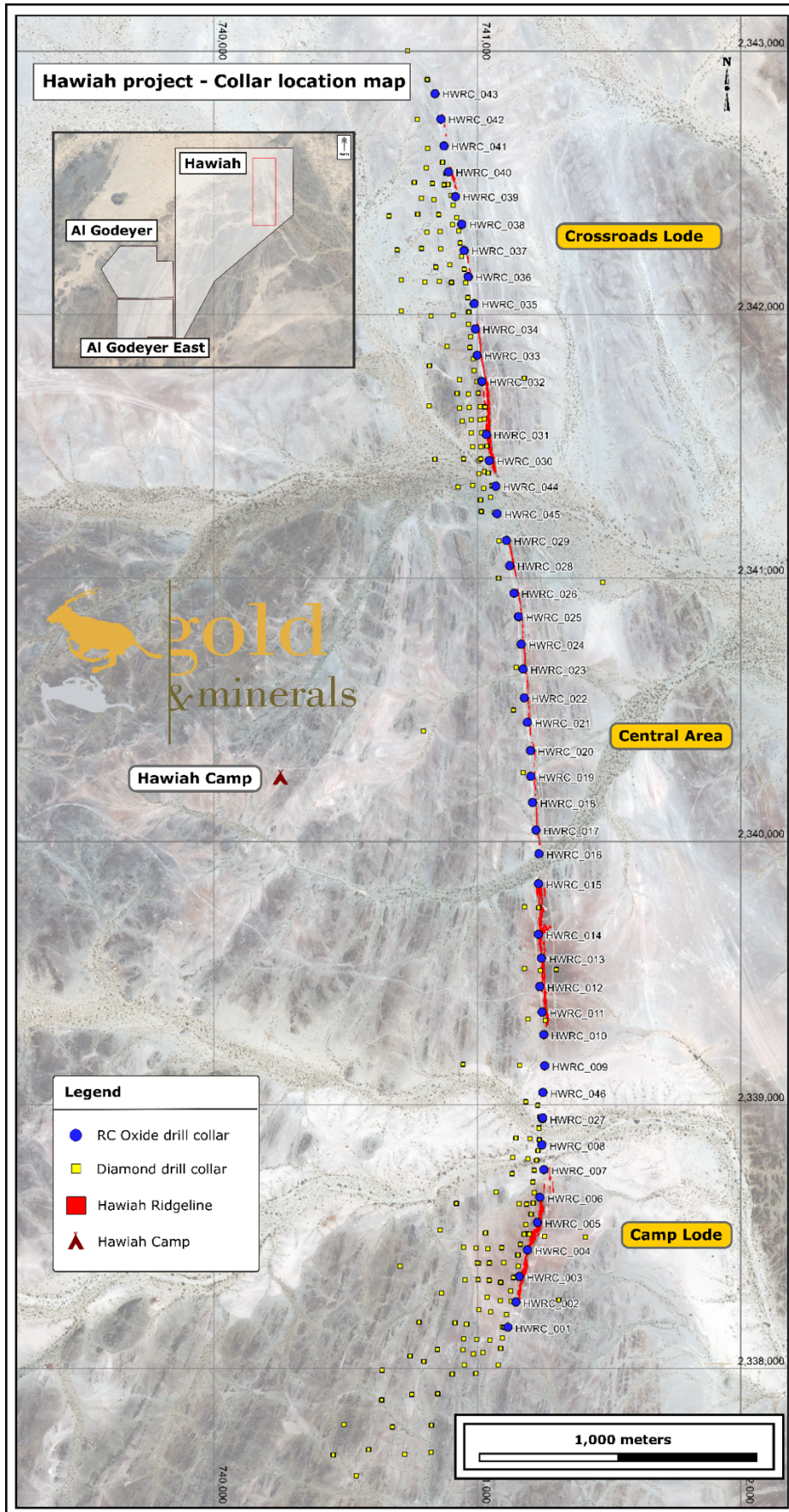
Figure 2 -Collar location map for the Phase 1 Oxide RC program (blue) and other resource drilling (yellow)