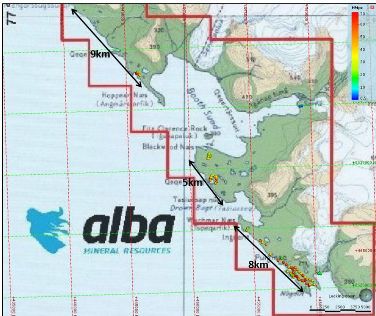
Figure 1: Sample locations coloured by THM% and showing the length of coastline identified to host ilmenite-bearing sands in active beaches and raised beach terraces

Table 2 (at the end of this release) shows that the weighted average grades from the 65 active beach and raised beach terrace samples equates to 20.4% Oversize (+2mm), 2.2% Clays (-53µm) and 46.7% THM (-2mm to +53 µm). Samples 36, 37, 102, 103 and 126 are excluded from Table 2.