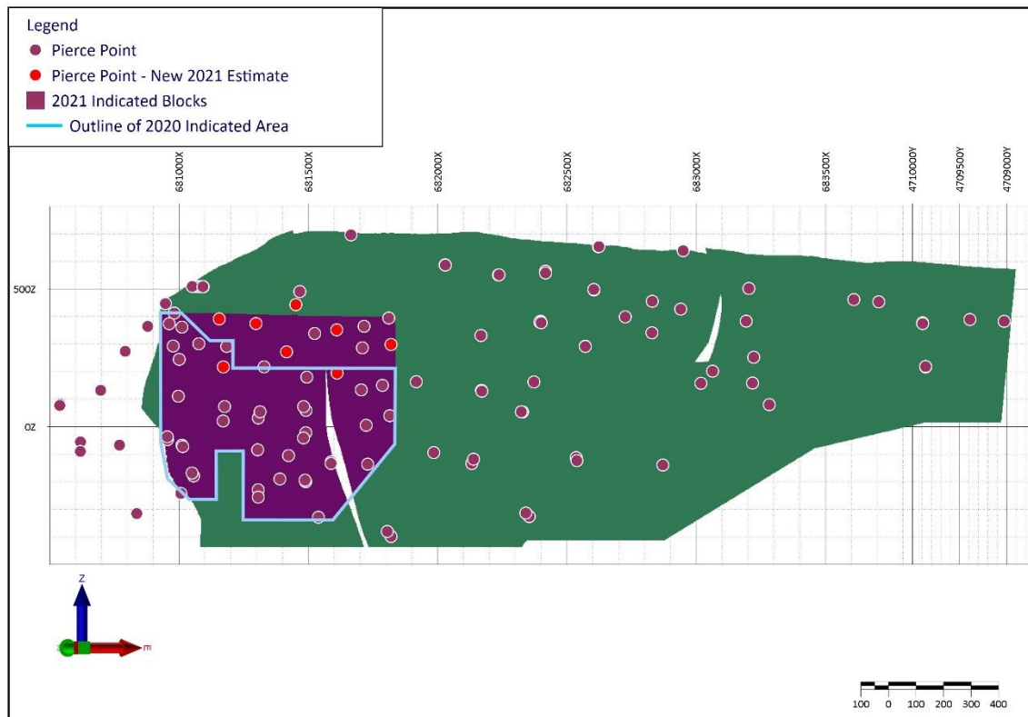
FIGURE 2b: AMS' resource block model for Toral 2D showing increase in indicated area