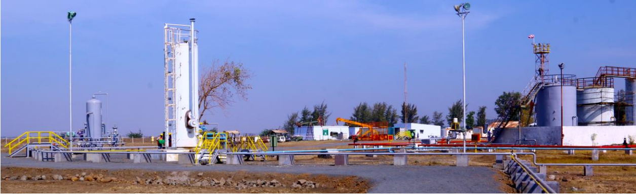
Figure 1 Bhandut Facility