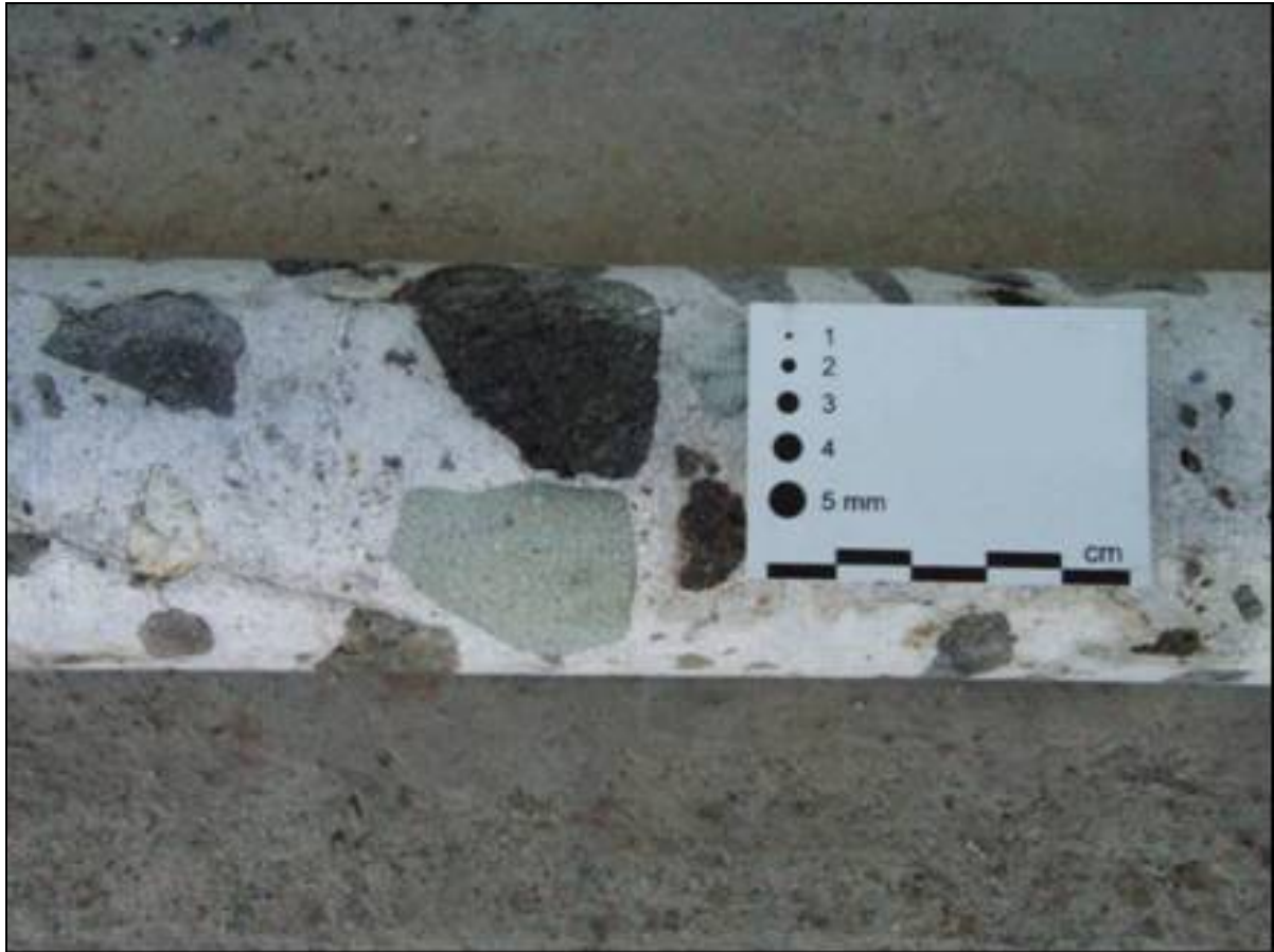
Figure 2: Mbetilonga Project - MBT003 and coarse angular basaltic-andesitic clasts hosted in well sorted sand to pebble sized limestone matrix.