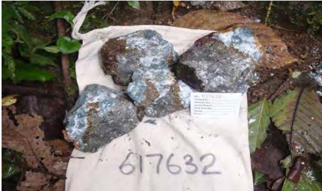
Figure 4: Mbetilonga Project - Sample Number 617632.