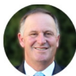
Rt Hon Sir John Key, GNZM AC