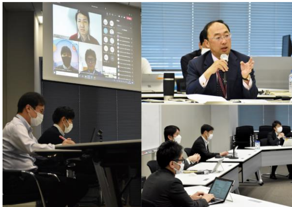
Briefing session of company-wide Transformation Project Step 2 (February 8, 2022)