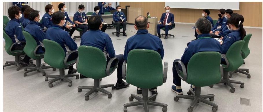
Held at Communication Systems Center (April 15, 2022)