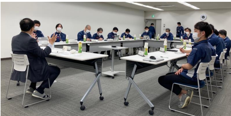
Held at Power Device Works (April 12, 2022)