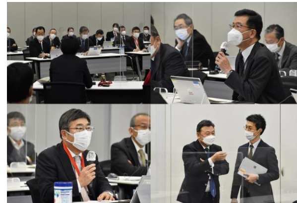
Briefing session for Executive Officers and Senior Executive Officers (February 18, 2022)