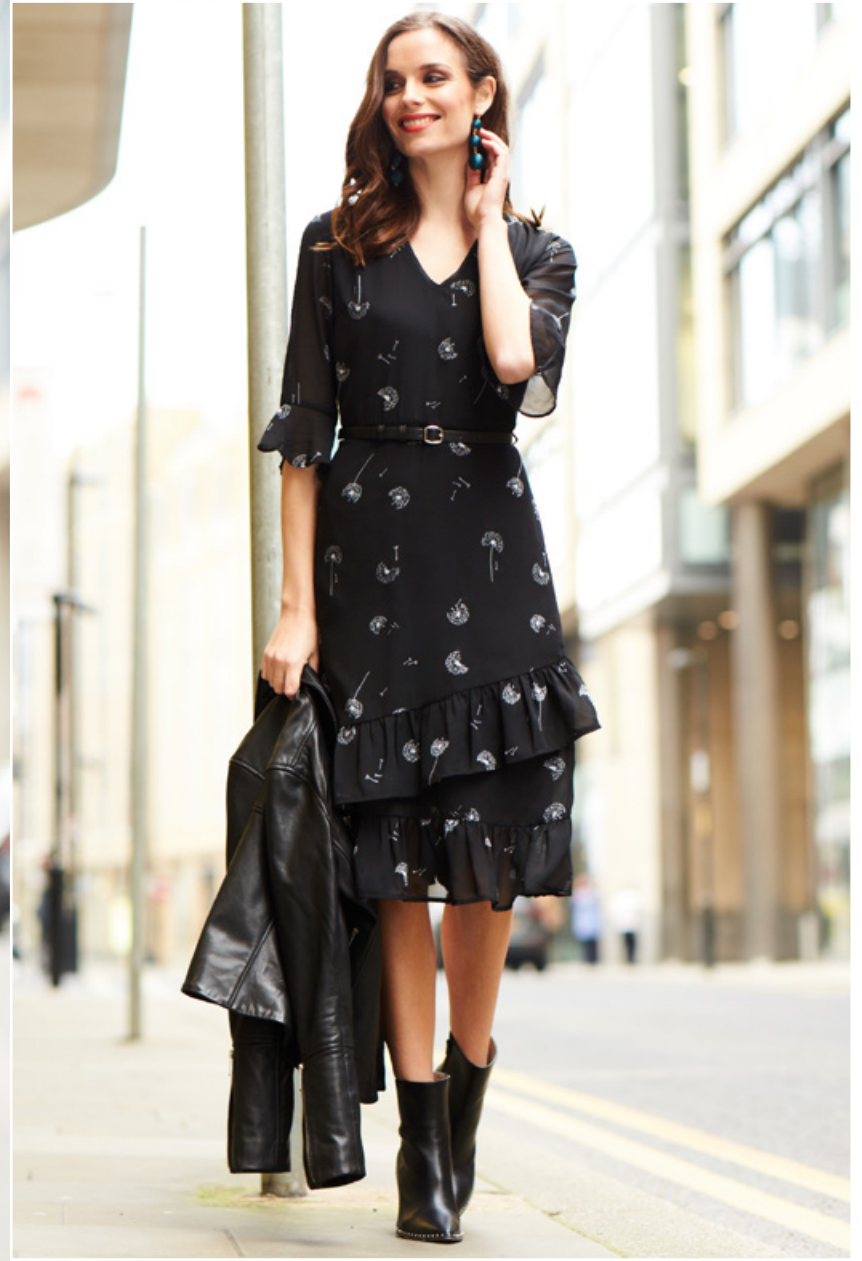
BLACK & WHITE FALLING DANDELION PRINT DRESS £69

Also available in Dark Green (pg 9) Burgundy (pg 4)