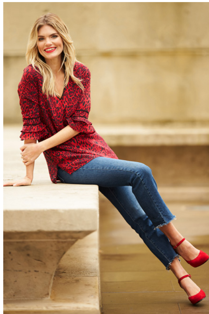
RED LEOPARD PRINT FLUTE SLEEVE TOP £45 Dress also available (pg 16)