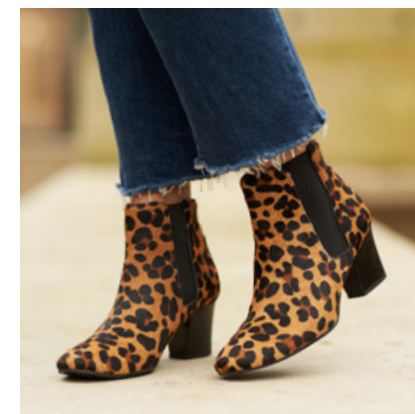
LEOPARD PRINT CHELSEA BOOT £95