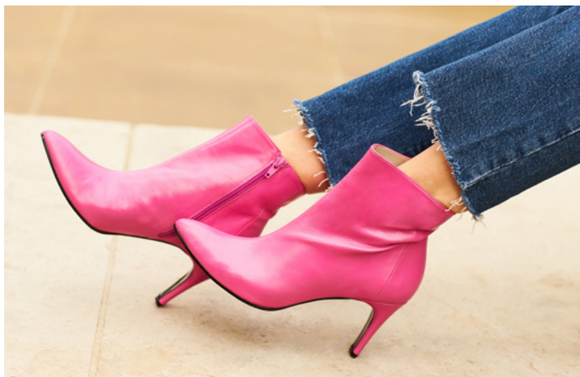
PINK LEATHER ANKLE BOOT £95