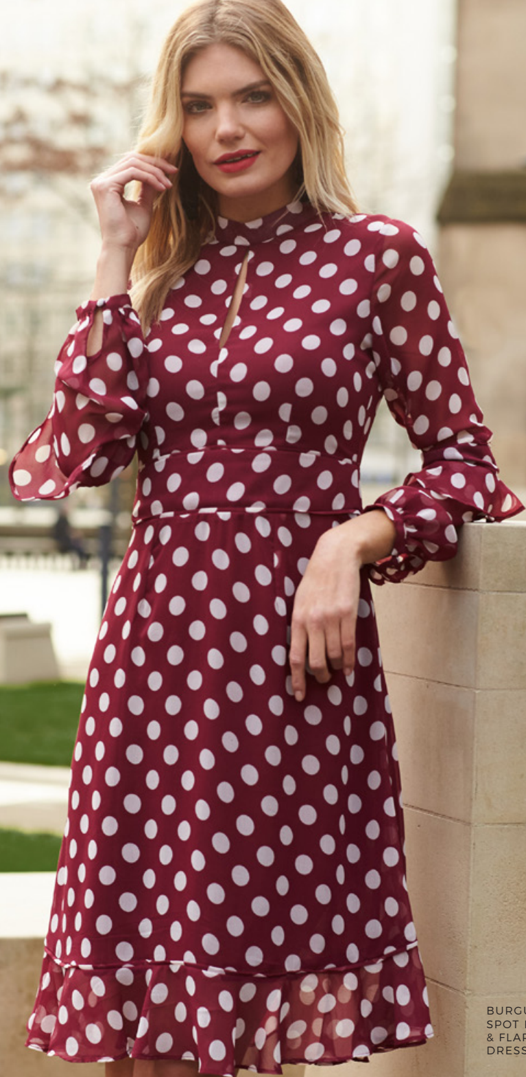
BURGUNDY SPOT PRINT FIT & FLARE RUFFLE DRESS £69