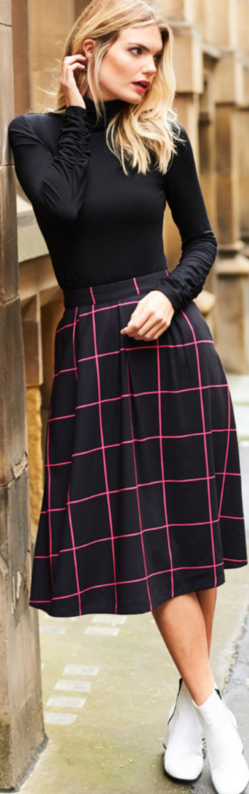
BLACK ROLL NECK RUCHED JERSEY TOP £35