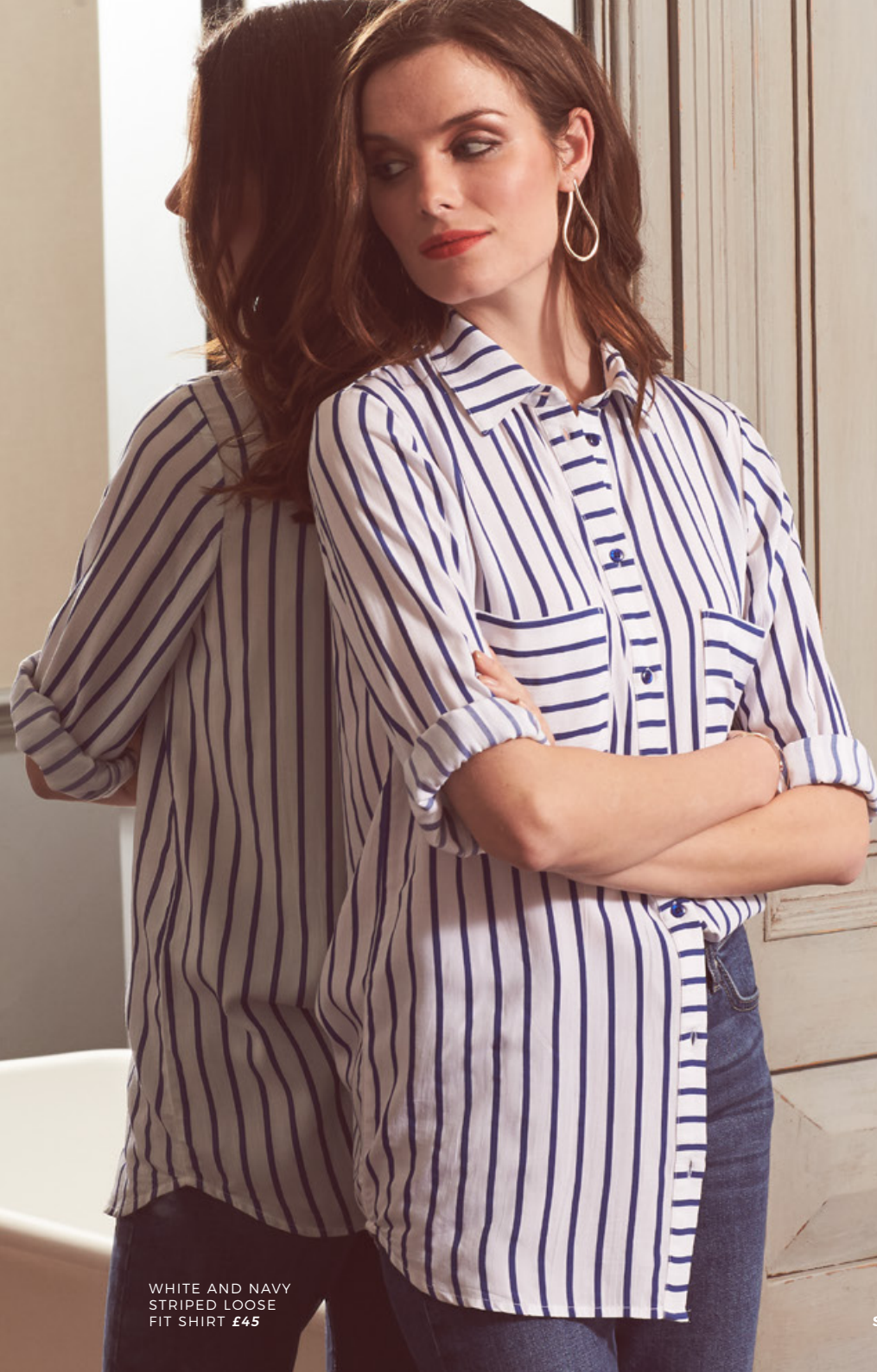
WHITE AND NAVY STRIPED LOOSE FIT SHIRT £45

Love the clothes. Amazing quality, affordable plus you don't see everyone in the same thing... you allow us to be individual!!* ”