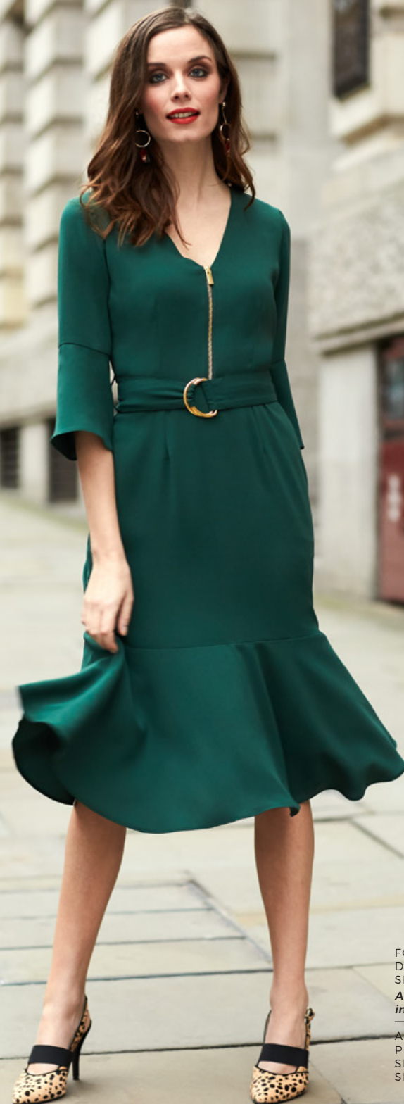
FOREST GREEN D RING FLUTE SLEEVE DRESS £59 Also available in Black online