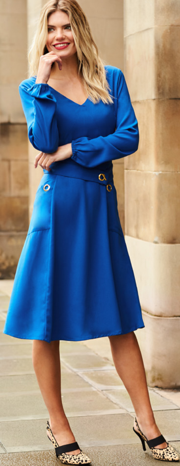
BRIGHT BLUE EYELET DETAIL FIT & FLARE DRESS £59