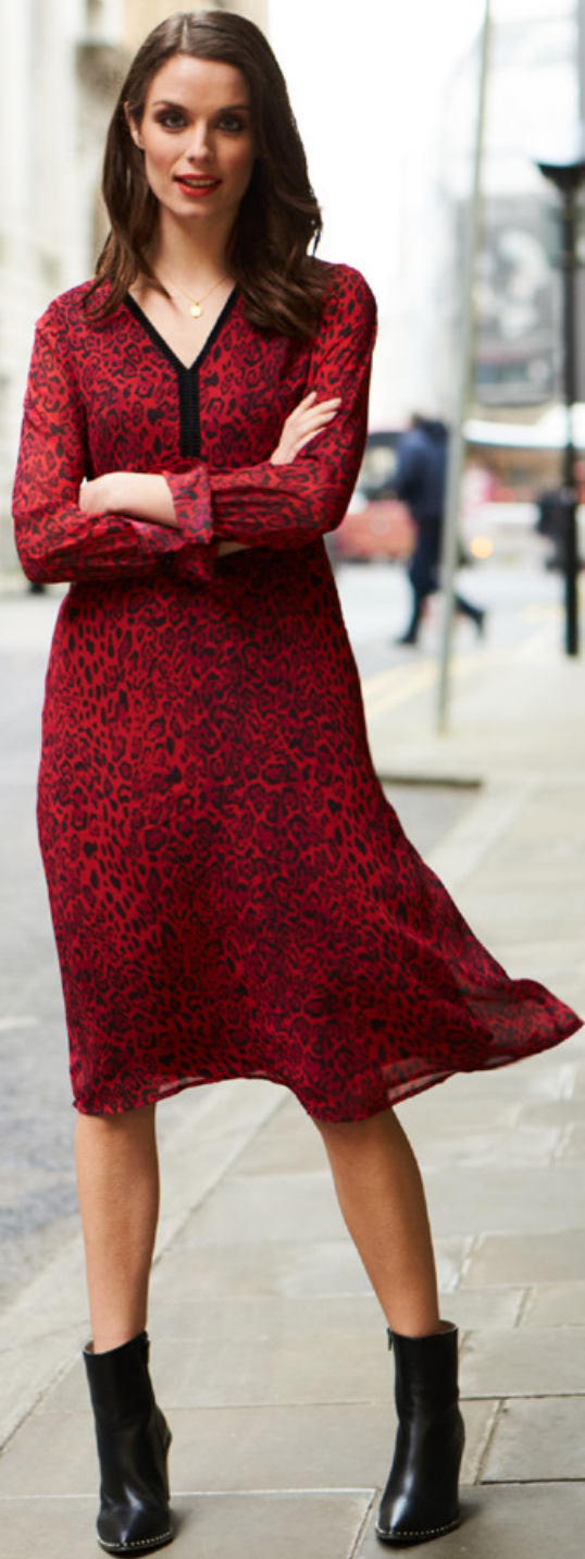
RED LEOPARD PRINT FIT & FLARE DRESS £69 Top also available (pg 25)