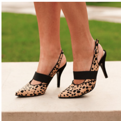
ANIMAL SPOT PRINT LEATHER SLINGBACK SHOE £85