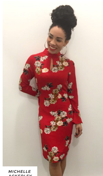
MICHELLE ACKERLEY GARDEN FLORAL SHIFT DRESS £69