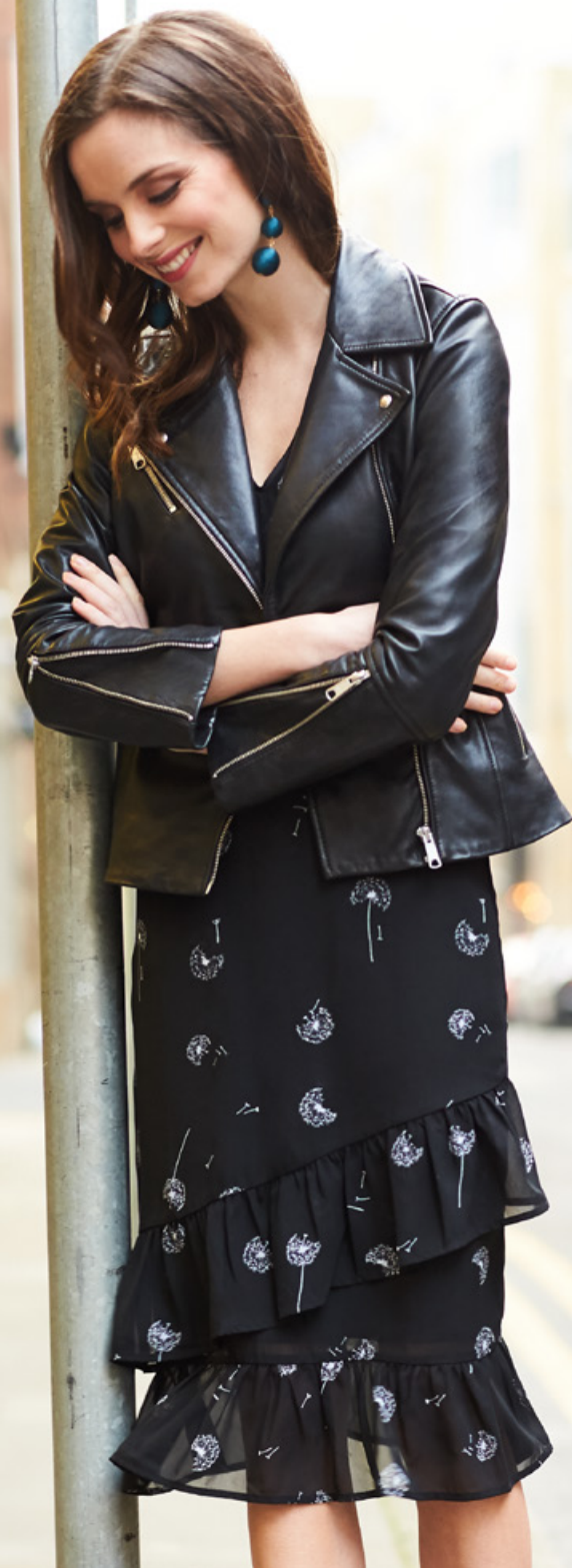
BLACK LEATHER STRAIGHT BIKER JACKET £249

Also available in Dark Green (pg 9) Burgundy (pg 4)