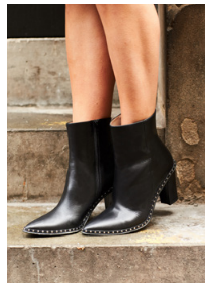
BLACK LEATHER STUD ANKLE BOOT £95