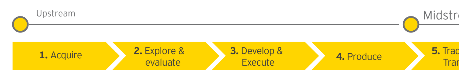
Figure 1: Kimmeridge limestones core value chain lifecycle <sup>9</sup>

Figure 1 below sets out the core activities that will take place in the development of Kimmeridge limestones, with the yellow sections highlighting activities within scope of this report.