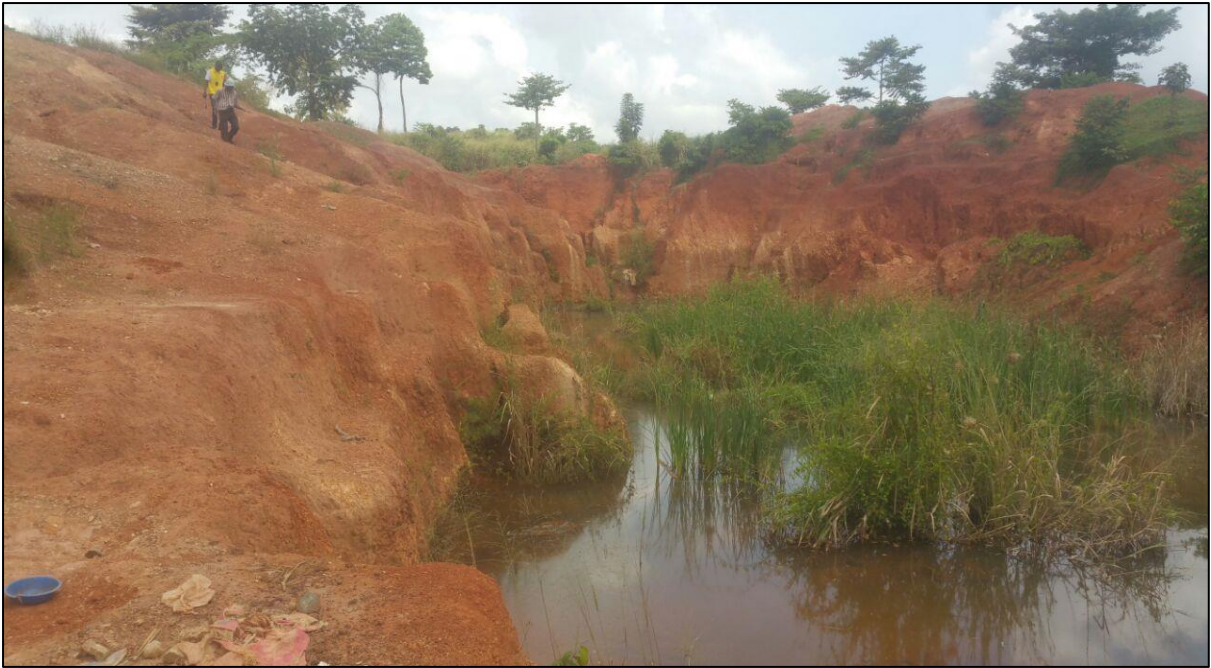
Figure 4 Large-scale 'open pit' type hard-rock artisanal workings observed within the Kineta North license;