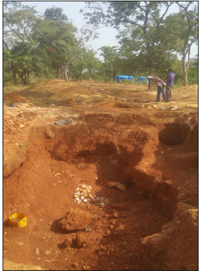
Figure 5 Underground hard-rock artisanal workings observed within the Kineta North license (left) and exploratory artisanal 'saprolite' workings along the mineralised trend (right).