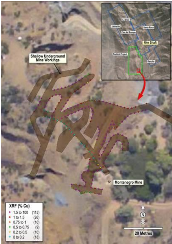
Figure 3: Pastizal lease