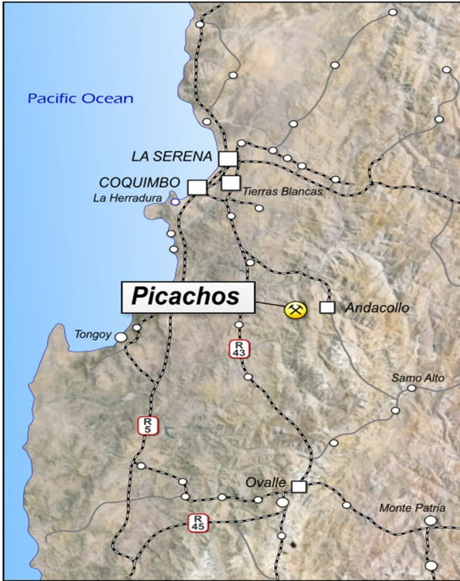
Figure 4 Picachos tenement location