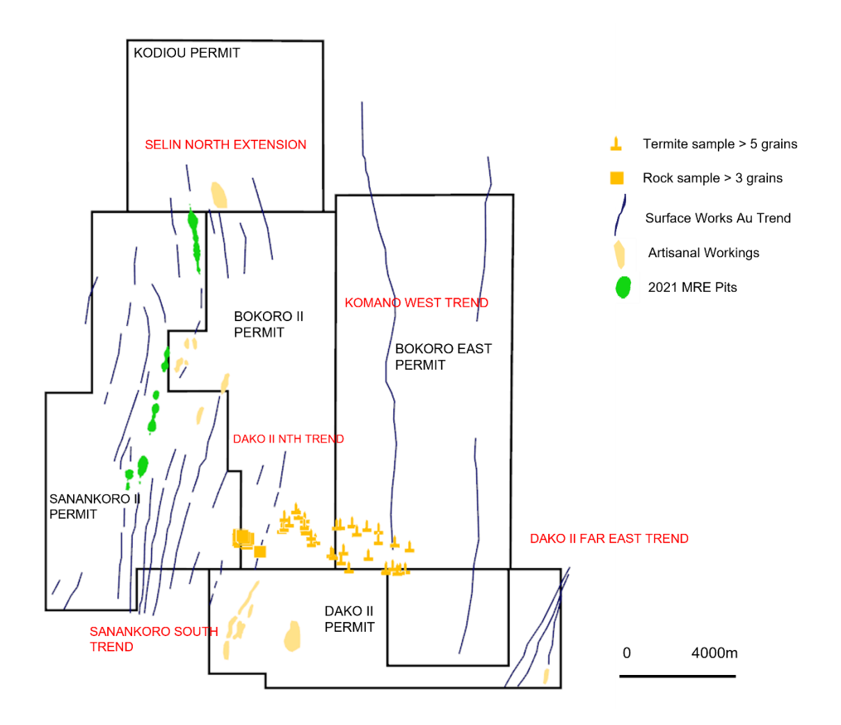
Figure 2: Termite and Rock sampling locations at the Bokoro II and Bokoro Est permits