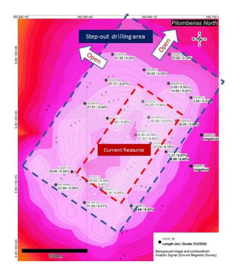
Figure 2. Selected Targets Based on Ground Magnetic Survey