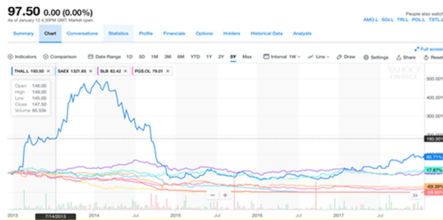
5 - Year Price Seismic Pier Group vs. THAL

Seismic Pier Group: CGG, PLCS, PGS, SLB, SAEX.