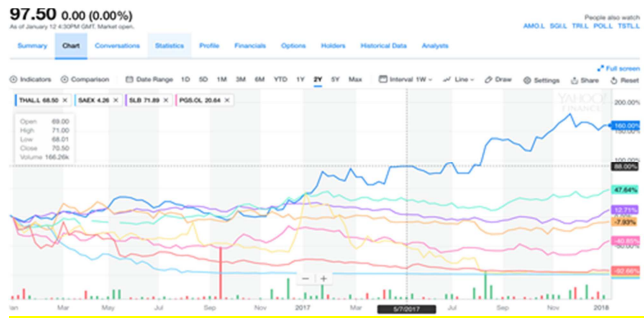
2 - Year Price Seismic Pier Group vs. THAL (blue)