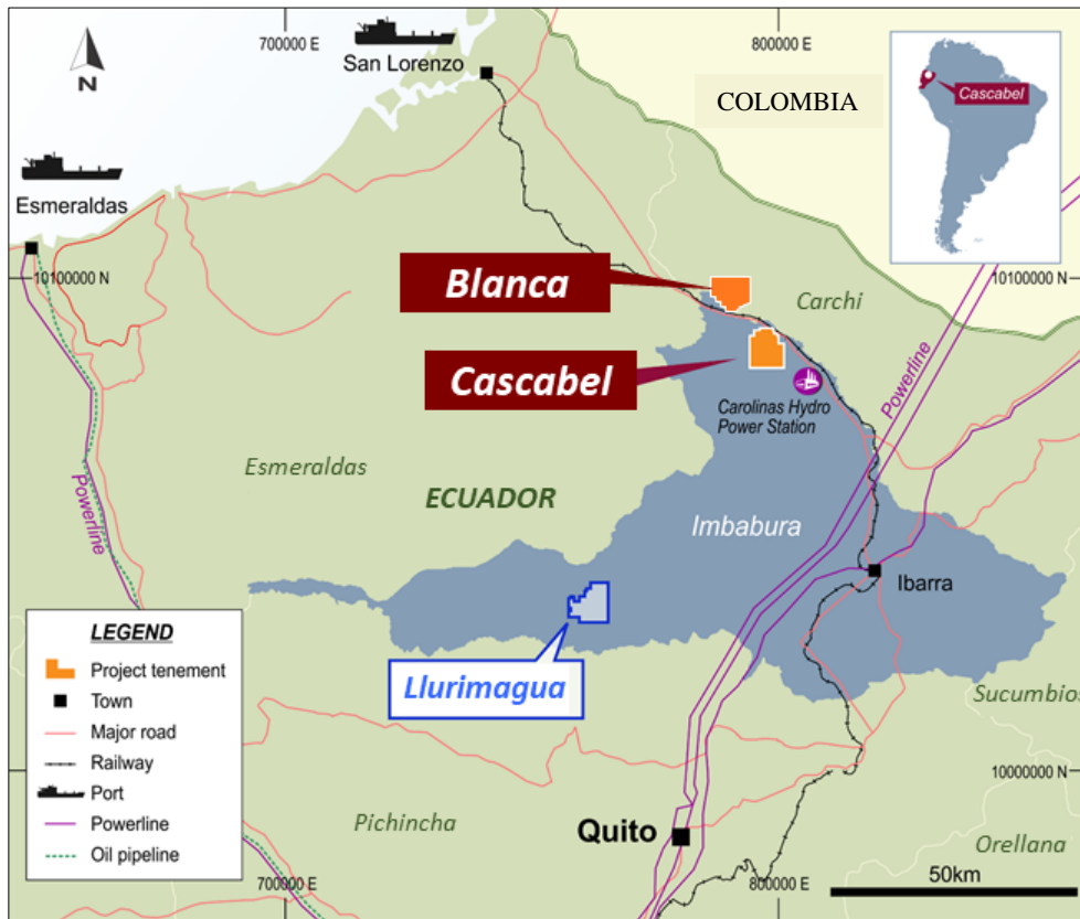
Figure 1: Location of the Blanca Project, Northern Ecuador.