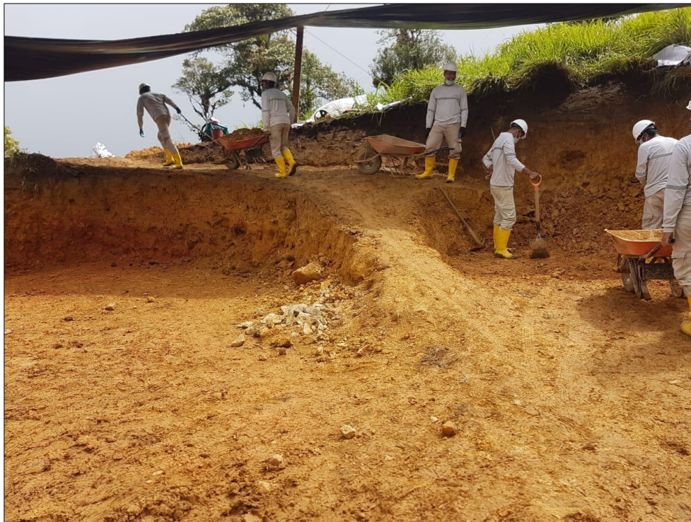
Figure 2: Drilling crews finalising site preparations at Cerro Quiroz ahead of arrival of the drilling machine today.