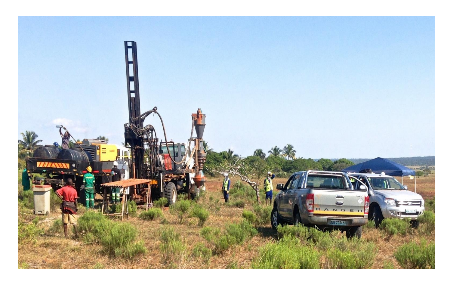
Figure 1. 2014 Scout drilling programme at the Jangamo Project

The first batch of samples has now arrived at the lab with the remaining samples expected in the short term. Results from all the assaying are expected in coming weeks.