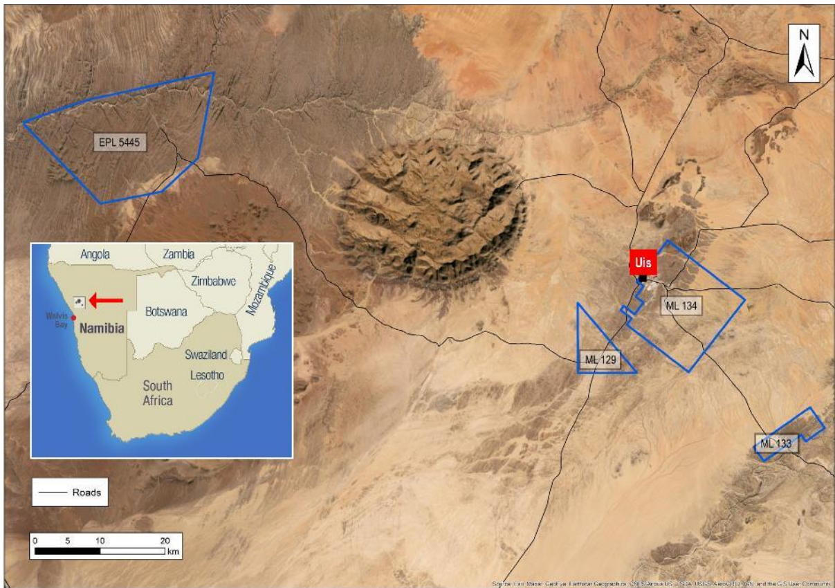
Figure 4: Andrada's mineral licenses in the Erongo Region of Namibia. ML134, ML133 and ML129 occur within a 40 km radius of the town of Uis.