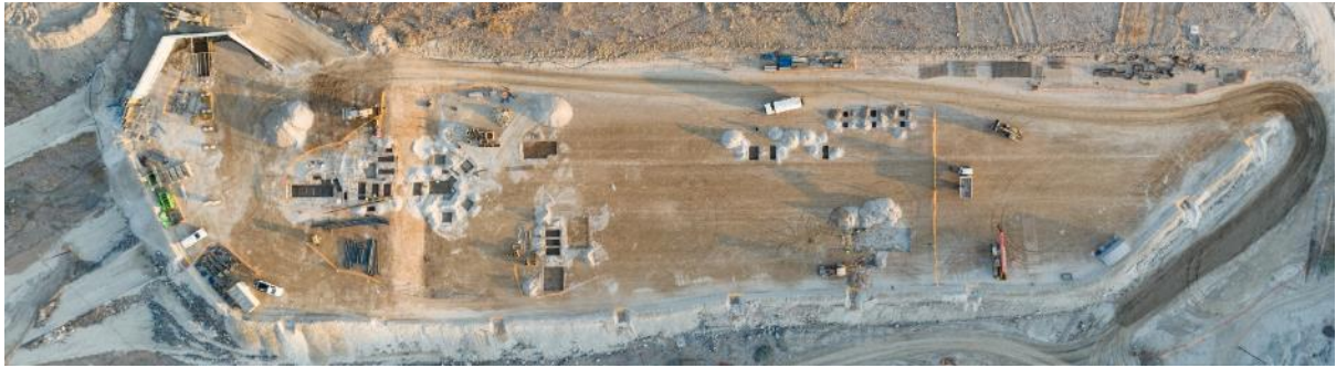
Figure 3: Lithium pilot plant construction: May 2023