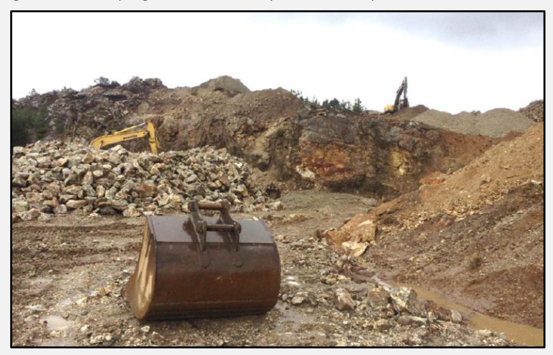
Figure 1. Bulk sampling activities underway at the NOA Deposit

commercial, operational and environmental benefits for the larger development. Portugal has a vibrant ceramics industry and lithium enriched feldspar/quartz is a sought-after material."