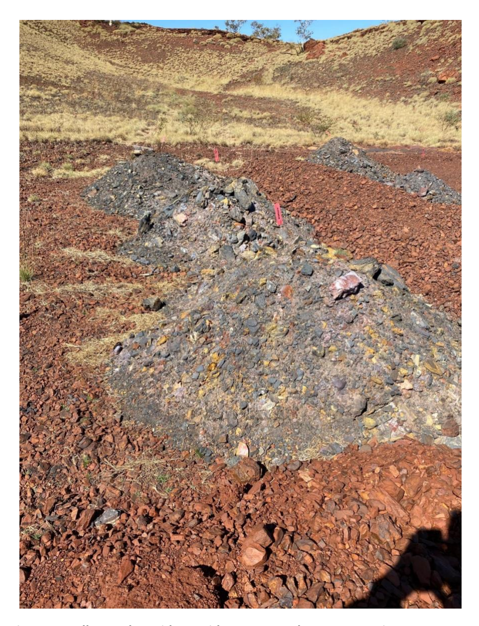
Figure 2: Bulk sample residues, Ridge C, Hancock Iron Ore Project, June 2022

The Company looks forward to updating the market as more news becomes available.