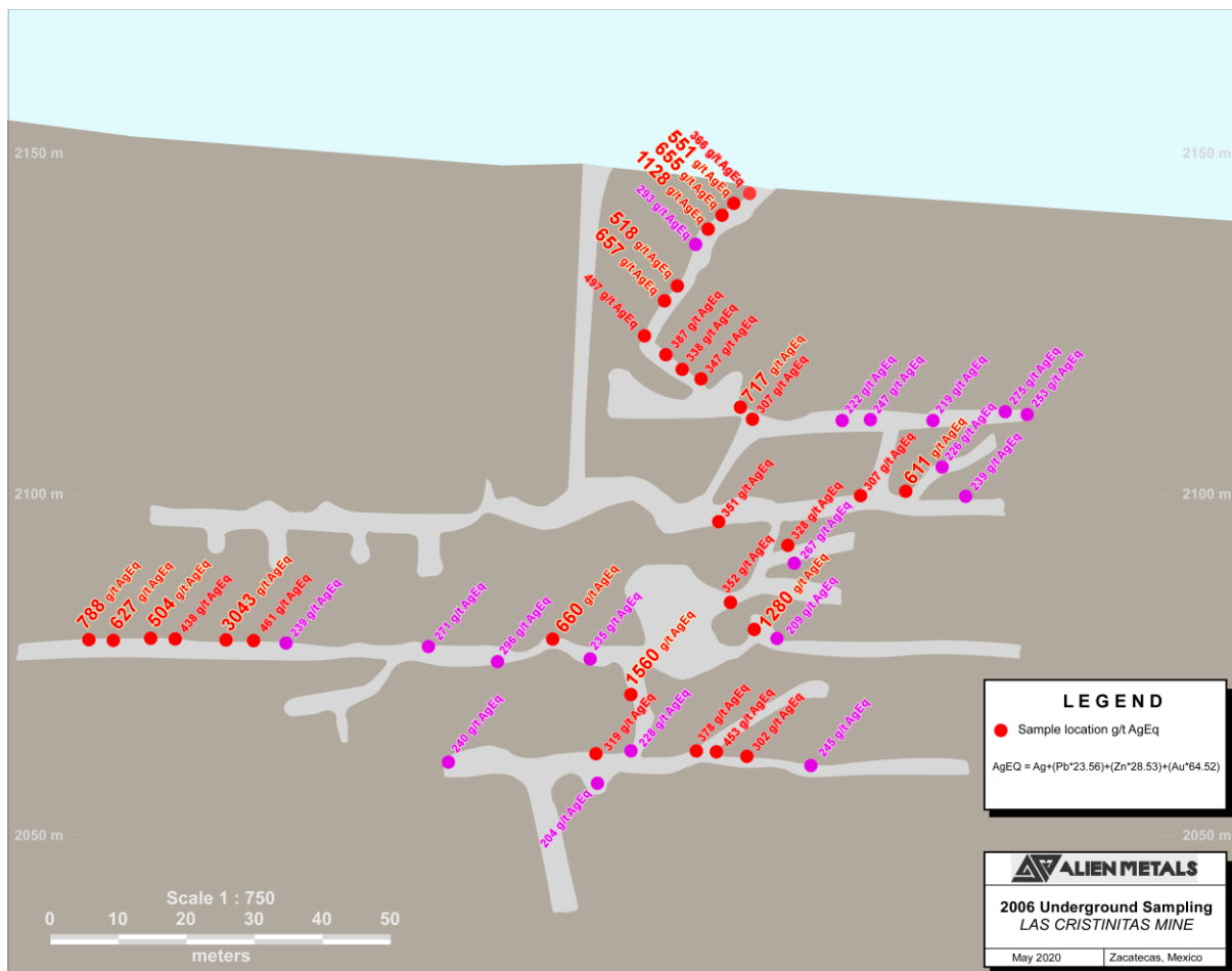
Figure 1: Las Cristinatas historic mine 2006 sampling results showing high grades silver results, San Celso Project (Purple samples < 300 g/t Ag)

The follow up underground sampling program commencing shortly is designed to confirm previous sampling as well as infill certain gaps to get a complete picture and understanding of the main mineralisation. This will also enable final planning of drilling to follow.