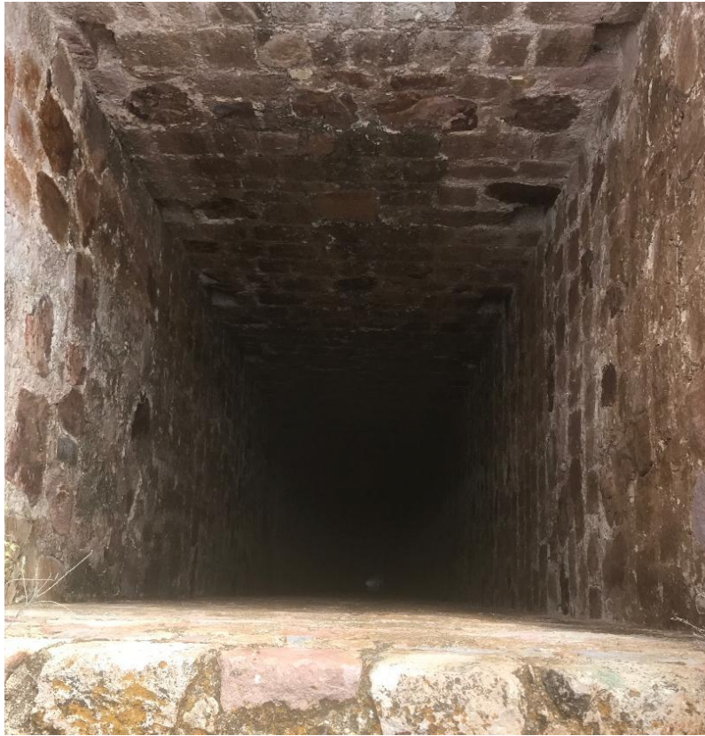
Figure 3: Central historic shaft, Los Campos Project