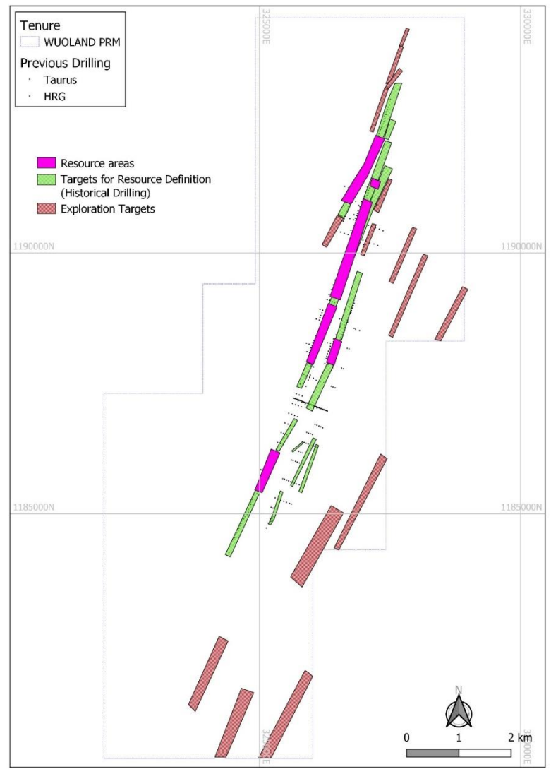
Figure 3: Outline of areas included in resources, targets for potential resource expansion and exploration target areas