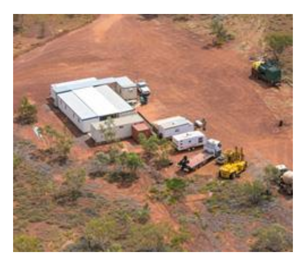
Figure 3: Camp accommodation, kitchen and laundry units on site in NT

From a technical aspect, Alien is excited to soon be able to map and sample all the underground workings 'from the inside' of the orebody but also hope to be able to do this in a very selective and specific exploratory drilling in-situ, so to speak, underground.