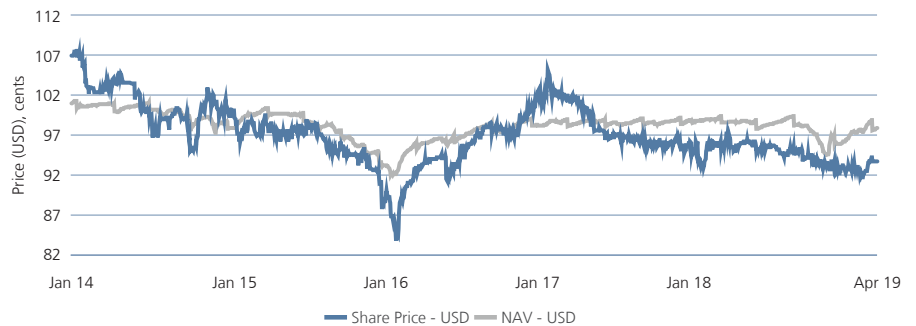
Share price and Net Asset Value (NAV) movement is representative of USD. Past performance is not a reliable indicator of future results. Source: U.S. Bank Global Fund Services (Guernsey) Limited and Bloomberg.