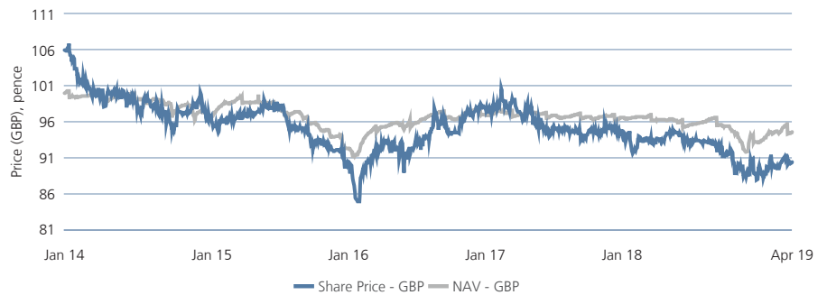
Share price and Net Asset Value (NAV) movement is representative of GBP. Past performance is not a reliable indicator of future results. Source: U.S. Bank Global Fund Services (Guernsey) Limited and Bloomberg.